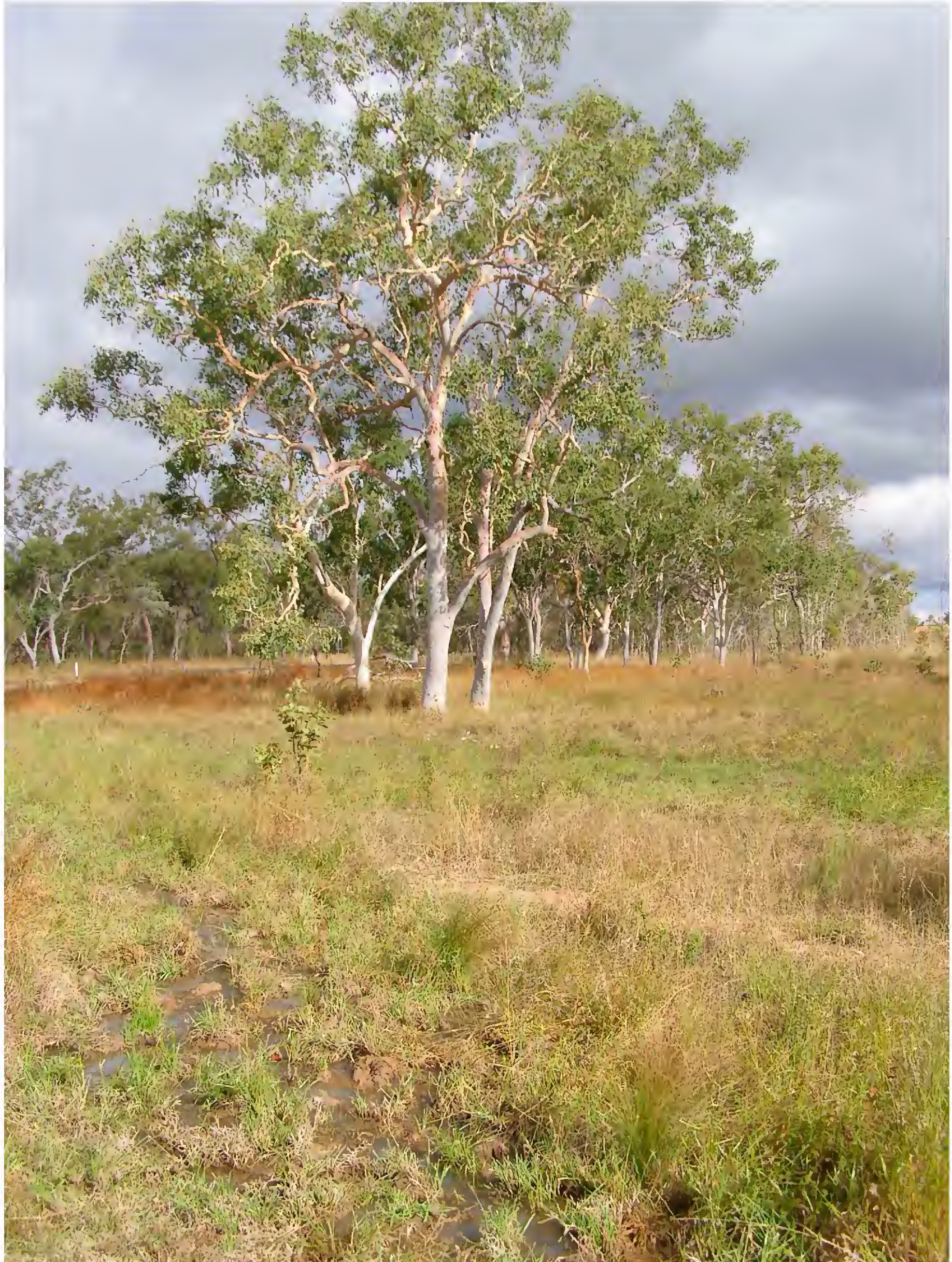
Fig. 3. Ephemeral wetland habitat near Undara, Queensland, containing a population of Utricularia blackmanii .